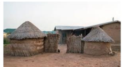
Traditional huts in Ghana's Northern Region

The north of Ghana experiences significant dry periods due to its proximity to the Sahara Desert. 8 The harsh climate contributes to adverse economic conditions in the region, where the main economic activity is agriculture. 9 In comparison, southern Ghana experiences a higher level of economic development, and there is a corresponding trend of migration from the north to the south of Ghana where people seek better economic outcomes and access to services. 10 This in turn contributes to underdevelopment in the north, reinforcing the cycle of poverty. 11