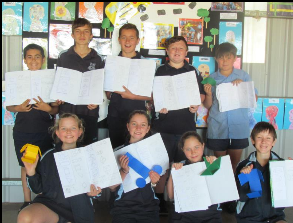
The year 5's and 6's presented their 3D shapes on assembly this morning.